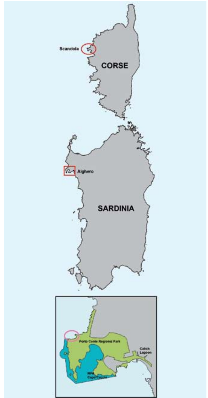
Fig. 1 - Map of Corsica, with the red ellipse that highlights the location of the Scandola Nature Reserve; in Sardinia, in the red square, the area of the Porto Conte Regional Park, adjacent to the city of Alghero. The green box represents the Park area, the "Capo Caccia Isola Piana" Marine Protected Area in dark blue and the Osprey nesting area with the pink ellipse. / Mappa della Corsica, con l'ellisse rossa che evidenzia la localizzazione della Riserva Naturale di Scandola; in Sardegna nel quadrato rosso l'area del Parco Regionale di Porto Conte, limitrofo alla città di Alghero. Nel riquadro in verde è rappresentato il territorio del Parco, in celeste scuro l'Area Marina Protetta "Capo Caccia Isola Piana" e con l'ellisse rosa l'area di nidificazione del Falco pescatore.

telescope, a 10x42 binocular, and a Nikon Coolpix P950 camera, and it was carried out by LIPU, General Directorate for Civil Protection of the Sardinia Region/ISPRA (Istituto Superiore per la Protezione e la Ricerca Ambientale) and Sardinian Research Group on Osprey. Behaviour was recorded on data sheets (Altmann, 1974) e.g. activity or display by one of the partners, feeding activity, interaction with an intruder. (Fig. 1).