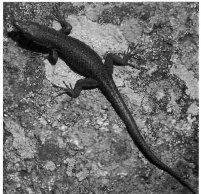
Fig. 1 - A. bedriagae from Punta Balistreri (Limbara Mountain northern Sardinia).

Lanza et al. (1984) hypothesised that this species has an unexpected capacity of dispersion in clearly unsuit