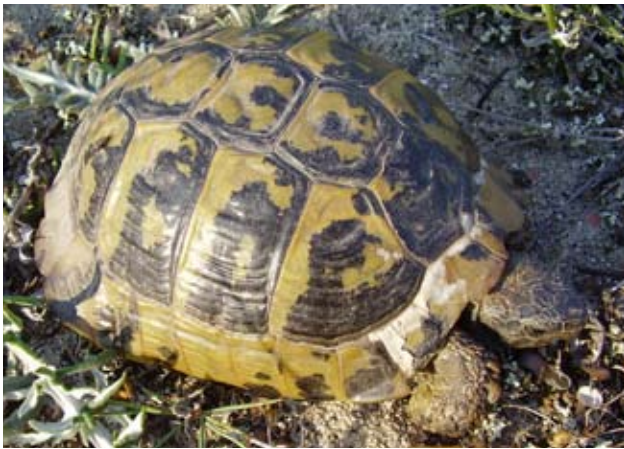
Figure 6. Adult Testudo hermanni boettgeri from Greece.