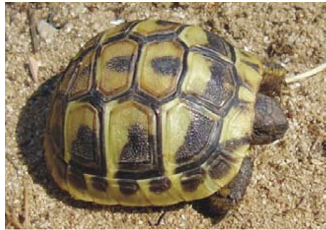
Figure 7. Hatchling Testudo hermanni boettgeri from Greece.

dimorphism starts to appear when the carapace reaches a length of about 10 cm, corresponding to 6–7 yrs of age. Males are smaller than the females (by approximately 12%), with a more trapezoidal form (seen from above) due to an increased width of marginals 9–10 (Willemsen and Hailey 2003). Males possess a longer tail (26% of the length of the carapace compared to 14% in females) that is also thicker at the base, the supracaudal scute is strongly incurved, and the rear part of the plastron has a wider opening than in females. In both sexes the tail has a well-developed terminal horny claw-like scale. The young cannot be distinguished from adult females, except from a paler coloration in the early life stages. Hatchlings are on an average 30 to 36 mm long for a weight ranging between 9.6 and 12.7 g.