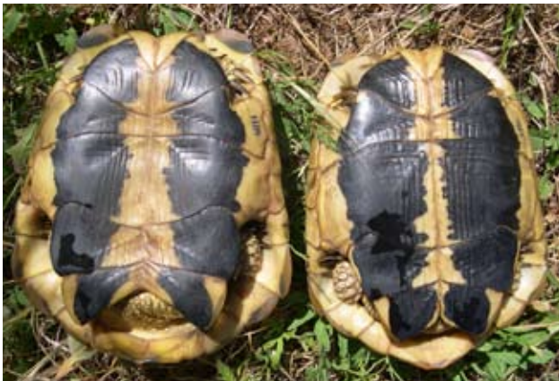
Figure 2. Adult Testudo hermanni hermanni from north Minorca, Spain; top and bottom left: male, bottom right: female.