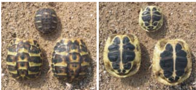
Figure 5. Hatchling and juvenile Testudo hermanni hermanni from south Minorca, Spain.