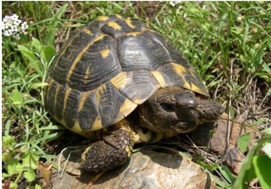
Figure 1. Adult male Testudo hermanni hermanni (CL = 141 mm) from Albera, Catalonia, Spain.

Taxonomy. — The taxonomy of the species has been complicated and confusing above the species level (van der Kuyl et al. 2002; Lapparent de Broin et al. 2006a, b; Parham et al. 2006; Fritz and Bininda-Emonds 2007) as well as within the species (Bour 2004a, b; Perälä 2002a, 2004; Fritz et al. 2006). Regarding its classification above the species level, Testudo hermanni has succes-