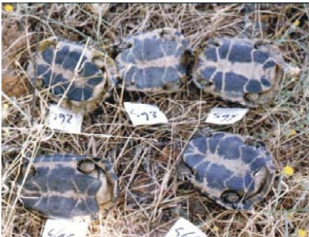
Figure 8. Adult Testudo hermanni boettgeri from Sparta, Greece. This specific pigmentation is only characteristic in the Peloponnese area.

The carapace is high, with an oval form in females and a sub-trapezoidal form in males. Growth rings are well marked, except for old specimens which can in extreme cases present an entirely smooth carapace. The plastron is rigid, flat in females and slightly concave in males. Sexual