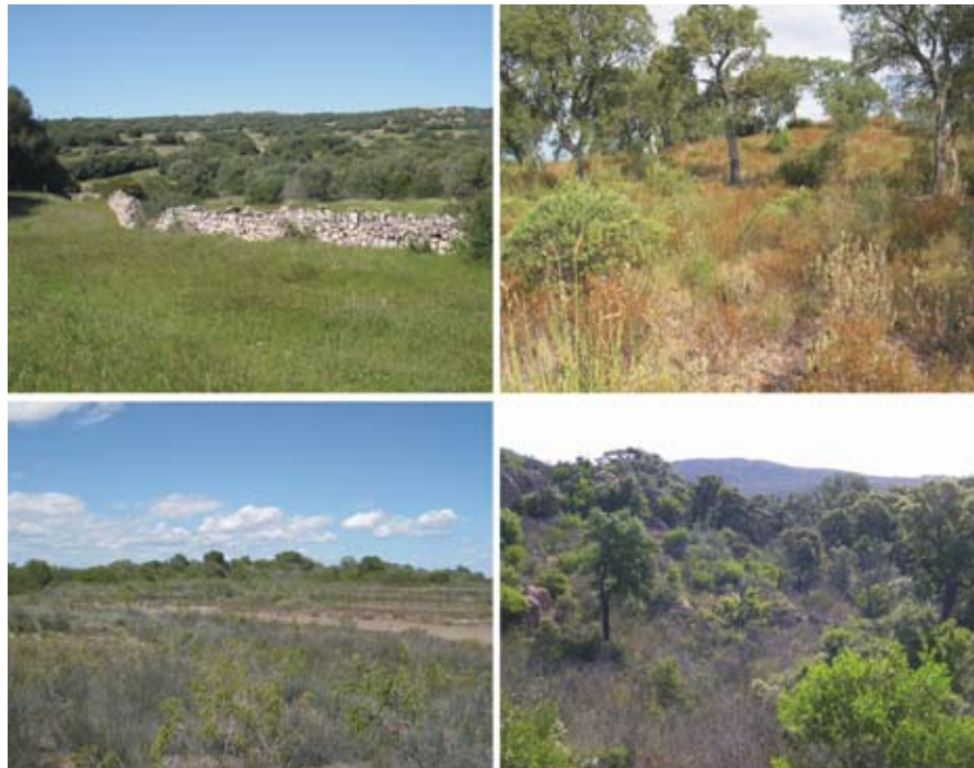
Figure 9. Testudo hermanni hermanni habitats. Top left: agricultural landscape of Minorca, Spain; top right: Albera, Spain; bottom left: Ebro Delta, Spain; bottom right: Corsica, France.