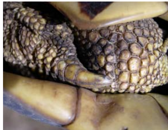
Figure 3. Ventral view of the tail of an adult male Testudo hermanni hermanni from Ebro Delta, Spain, showing the terminal horny claw-like scale.